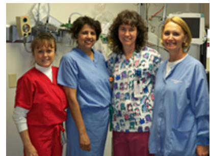
Recovery Room Nurses