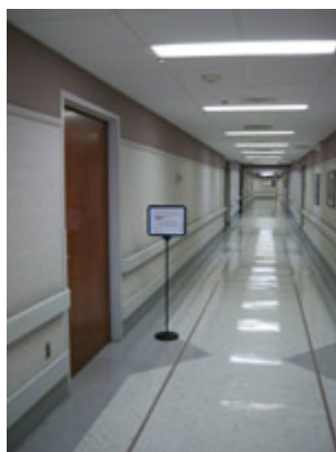
Pre-Admission Testing Entrance

“outpatient surgery” door and proceed to the first door on your left (pictured to the left) after the vending machines. You will not be able to proceed with surgery without having the necessary tests completed ahead of time. Please be sure to follow all instructions given to you during this appointment. Patients who will be undergoing a lumbar fusion with or without fixation are also asked to attend one of our