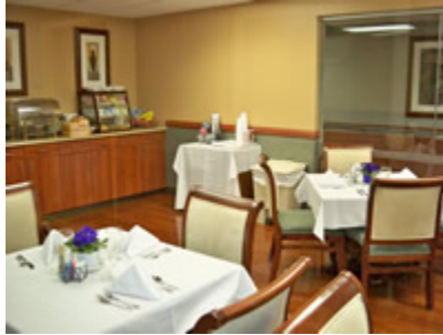
3rd Floor Dining Room

When you leave the hospital, you will be given a list of discharge instructions , a prescription for pain medication, and an appointment to see Lindsey approximately 10-14 days after surgery. During the first appointment following surgery, you will most likely have your stitches or staples removed. If you had a microdiscectomy, lumbar laminectomy, or decompressive laminectomy, you will be given a prescription for physical therapy. If you had a lumbar fusion with or without fixation, we will take some x-rays so we can follow the fusion's progression over the next few months. Driving and work status will be discussed during this visit.