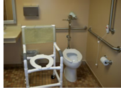
3rd Floor Commode

and their families. The day of surgery, a nurse will help you get out of bed and walk. It will be difficult because you will feel stiff and may have some back pain because of the surgery itself, but walking will help all of this improve. The day following surgery you will begin physical therapy with one of the therapists at the hospital.