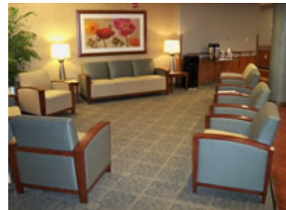
3rd Floor Family Waiting Lounge

Because decompressive laminectomies and lumbar fusions with or without fixation require a longer operation and hospital stay, these families are asked to wait in the family waiting lounge located on the 3rd floor (pictured to the right).