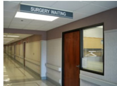
Outpatient Surgery Waiting Room

your surgery day has arrived, please drive around to the rear of the hospital where you will once again find the “outpatient surgery” entrance (pictured to the right). There is parking for you here, as well as a waiting room, which is located inside the first door on your right once you enter the hospital. Please wait in this waiting room until a nurse comes to take you back to prepare for your surgery. Families of those patients having a microdiscectomy or lumbar laminectomy can wait in this waiting room since they will not be staying overnight.