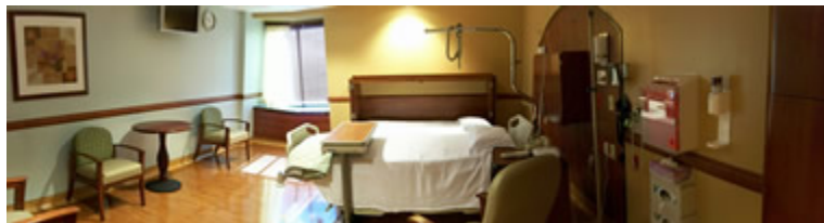
3rd Floor Patient Room