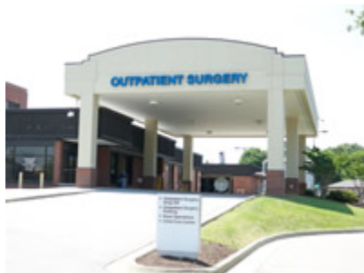
Outpatient Surgery Entrance